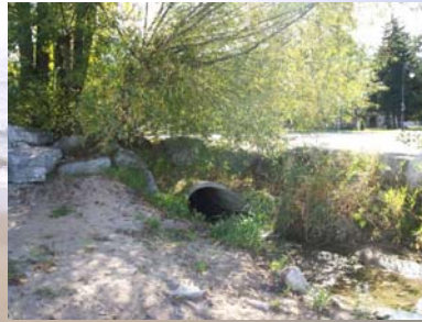
Miller Engineers & Scientists