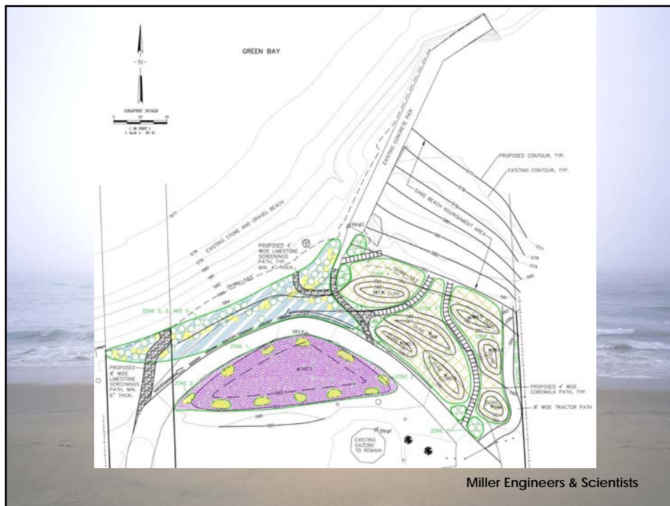
Miller Engineers & Scientists